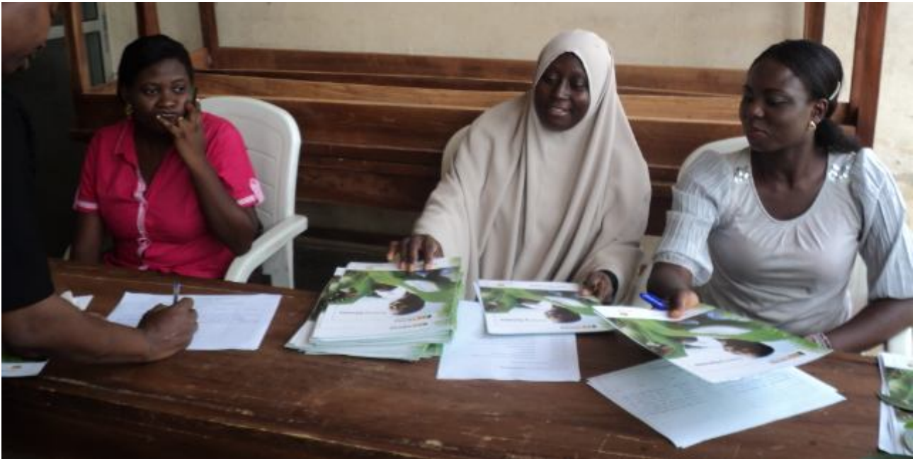
Registration of participants during the seminar