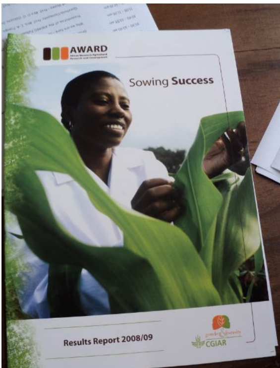
AWARD report cover used as seminar programme folder along with other AWARD promotional materials