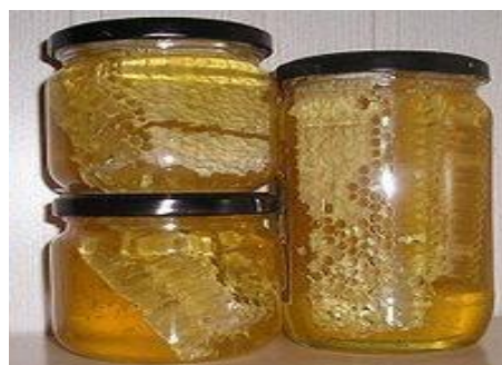
Plate 6: Stored Honey

This honey making in the farms is not a hectic job, but it yields much more money for the rural people. Honey production does not need extra land, or some machinery. It is a cottage industry in its own, no food and fodder is needed for the bees. Nectar is collected from the flowers freely by nature, through which the bees make honey and many bi-products such as the honey bees' wax, and many more. Honey has distinct germicidal properties and in this respect greatly differs from milk which is an exceptionally good breeding-ground for bacteria. Honey is a most valuable food, which today is not sufficiently appreciated. Its frequent if not daily use is vitally important (Chambers and Conway, 1992).