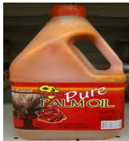
Plate 9: Stored Palm oil

Small-scale mills simply pack the produced oil palm in used petroleum oil drums or plastic drums and store the drums at ambient temperature. At this point, the stored palm oil (Plate 9) can be consumed by the family or taken to local markets for sale so as to make earning (Gustafsson, 2007). The socio-economic opportunity attached to oil palm production comes from three main areas: the demand for palm oil, the availability of palm nut trees and suitable climate, and the availability of labor. The local demand for palm oil is substantial. It is estimated that for every five people in Nigeria, perhaps two liters of palm oil or more are consumed each month for cooking (Gustafsson, 2007). It has been reported that, although once a significant exporter of palm oil, Nigeria is now an importer, and it is possible that some of this demand may be currently supplied by foreign imports (Gustafsson, 2007).