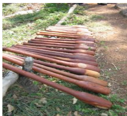
Plate 11: Pestle