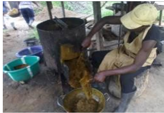
Plate 8: Palm fruit digestion