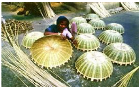
Plate 1: Basket making

Three dimensional bamboo woven products are handcraft made of bamboo strips and threads. This product range is very wide. The products are classified according to their form and function. This creates opportunities to utilize indigenous natural resources. A good example is the production of portable basketry which refers to baskets with a handle. There are many kinds of portable baskets. Some are made specifically for carrying flowers, or fruits and vegetables. They can be made in wide variety of shapes and sizes, ranging from fancy miniature baskets to large and strong baskets that can carry a load of up to 100kg (Yair et al 1999).