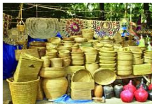
Plate 2: Storage containers

The parts of a basket (Plate 1) are the base, the side walls, and the rim. A basket may also have a lid, handle, or embellishments. Most baskets begin with a base. The base can either be woven with reed or wooden. A wooden base can come in many shapes to make a wide variety of shapes of baskets. The 'static' pieces of the work are laid down first. In a round basket they are referred to as 'spokes'; in other shapes they are called 'stakes' or 'staves'. Then the 'weavers' are used to fill in the sides of a basket (Yair et al , 2001).