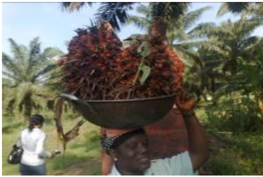
Plate 7: Harvesting Palm fruits