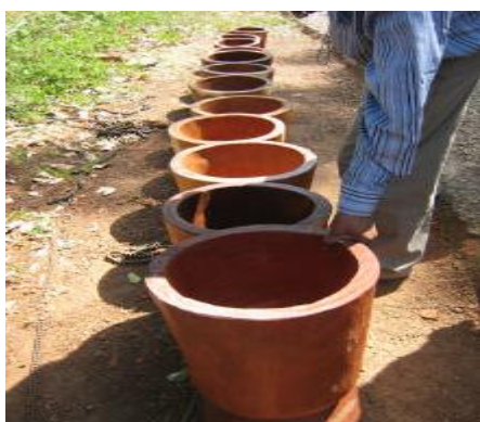
Plate 10: Mortar

Prosopis africana is generally known as Iron wood Tree in Nigeria. It is a common tree of the savannah region; belonging to the family Mimosaceae. It is variously called; Kiriya (Hausa), Ayan (Yoruba), Ubwa (Igbo) and Gbaaye or Kpaaye (Tiv). Iron wood tree is widely utilized in Nigeria and other African countries. Its utilization serves as source of income/employment as well as ecological services. Most mortal and pestles are made from Prosopis africana because of its durability and ease to carve. Mortar and Pestle produced are sold in the market (See Plate 10 and 11) and at homes, as the case may be, to generate income. Arts and craft work (carving) and trading offered employment services to many people living in the rural area.