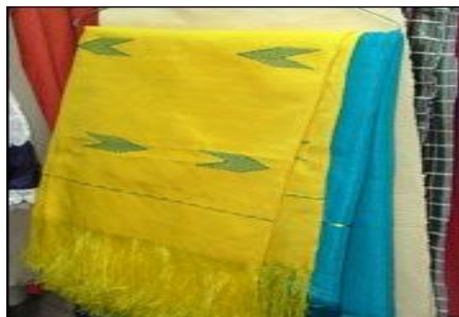
Plate 4: Aso oke sales point

where the rolled cotton is neatly inserted into the striker through the extenders. Finally, the material is now fit, ready to be worn (See plate 4) for occasions such as coronations, festivals, engagements, weddings, naming ceremonies, burials and other important events. The beauty of the woven cloth (Aso-Oke) is showcased when it is used as Aso-Ebi (a group of people e.g. friends, families etc dressed alike).