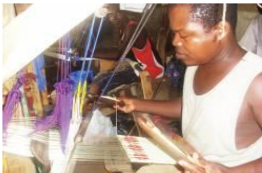
Plate 3: Weaving Process

While the patterning stage is the process of putting designs and patterns on the Aso-Oke, weaving is the last stage. This is