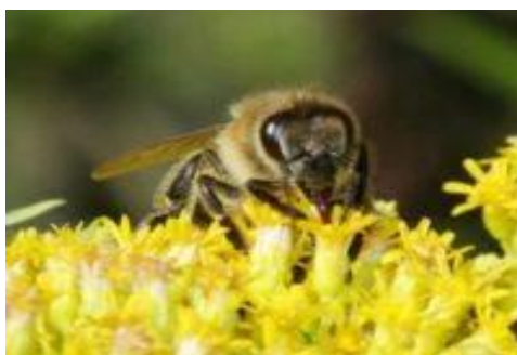
Plate 5: Bee feeding on nectar

culture. Bees gather nectar to make into honey for their own use as food (See Plate 5), but generally store more than they need, and this surplus the bee keeper takes away.