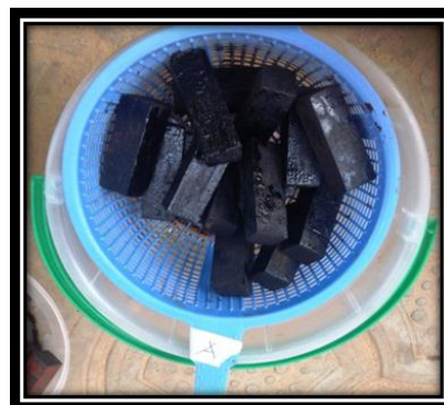
Plate 4: Solignum Treated Wood