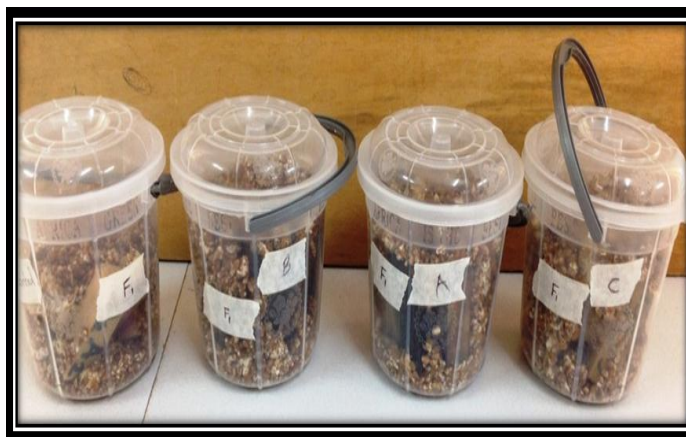
Plate 9: Wood Inoculated in the fungi