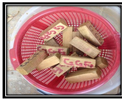
Plate 7: Control (Untreated)