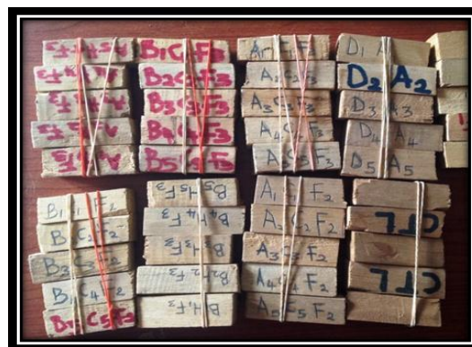
Plate 1: Wood Billet Samples

The wood species was cut to 105 test blocks (20mm x 20mm x 60mm) (Plate 1). The initial weight of the wood samples was taken and recorded as T 0 . Thereafter, the samples were oven dried at 103 o C for 24hours until constant weight was attained to reduce the moisture and also to sterilize the wood. This weight was recorded as T 1 . The extract preparation of Azadirachta indica was obtained according to the methods described by Owolade, (2000) and Achio, et al. , (2012), 300g of the powdered leaf was mixed with 1liters of distilled water, allowed to stand for 24 hours, sieved and further filtered using a filter paper. The extract was then transferred into a container and labeled for use. The spent engine oil and solignum were divided into two sets of 5 liters for hot and cold treatments respectively.