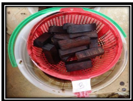
Plate 5: Spent Engine oil treated wood