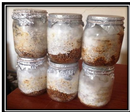
Plate 3: Pure Cultured Fungi