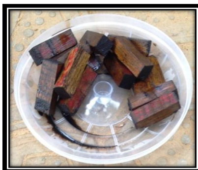
Plate 6: Neem leaf extract treated wood