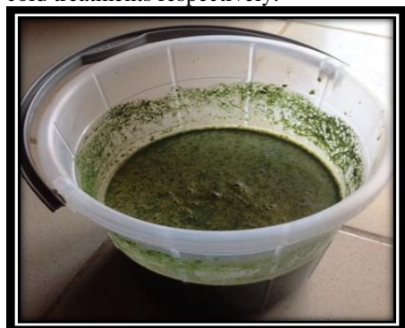
Plate 2: Extract Preparation

Treatment and preservative impregnation of the wood samples was carried out according to the methods described by Owoyemi and Kayode, (2007). A set of five samples were immersed into hot solutions of solignum, spent engine oil and aqueous extract of Azadirachta indica preservatives heated in an open tank (Plates 2 – 9). Heating was discontinued after 6 hours, allowing the wood samples and the preservative to cool together for 24hours after which they were drained on wire mesh and the samples weighed and recorded as T 2a . The second set, comprising of five samples were cold dipped into each of the preservatives for 24 hours, weighed and recorded as T 2b . The samples were kept in the laboratory for 72 hours for conditioning before exposure to fungi attack. Pure cultures of the fungi (brown rot ( Sclerotium rolfsii ) and white rot ( Pleurotus sajorcaju )) were grown on potato dextrose sugar agar (PDA). The treated wood samples were inoculated with the cultured fungi of white rot species, brown rot species and a combination of both fungi species in an enclosed transparent bottle for 12weeks. Untreated samples (control) were also exposed to fungi attack. After the 12 weeks exposure, the test blocks were removed, cleaned and then weighed. The final weight after exposure was obtained and recorded as T 3 (Perminderjit, 2014).