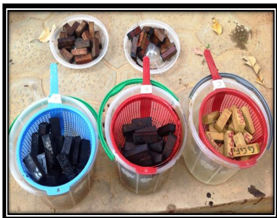
Plate 8: Hot Treated Wood Samples